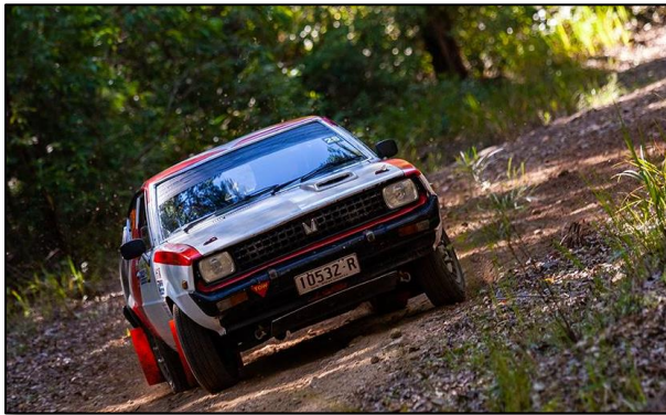
MATT RATH 3 rd Club Championship 1 st Rally Driver's Championship